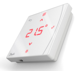
Danfoss Icon2™ Sensor 088U2120