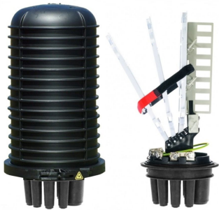
FOSC® 400 A8 Fiber Optic Splice Closure, Heat Shrink Cable sealing, one pre-installed 24-splice tray, with test valve